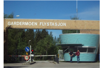
Location at Gardermoen Airport