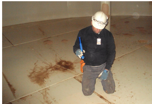
Inspection of bottom plates