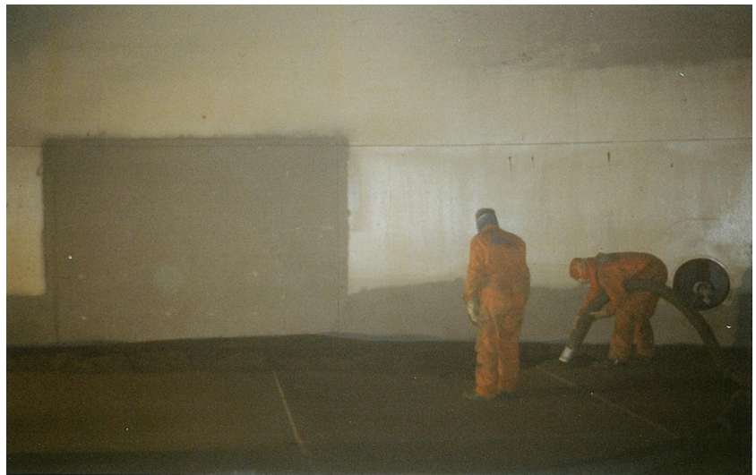
Internal coating work