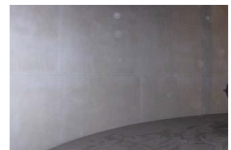
First blasting area