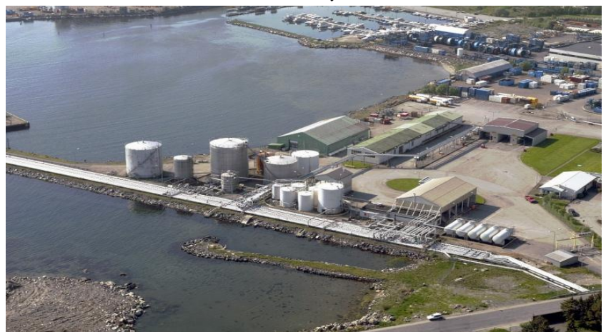
Norske Shell depot in Tananger