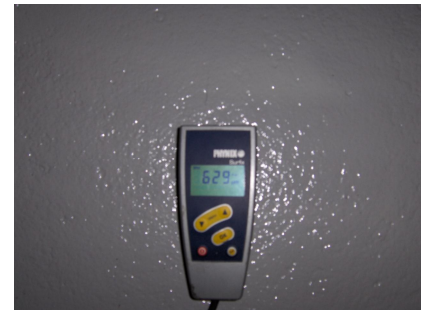
Dry film thickness measurements