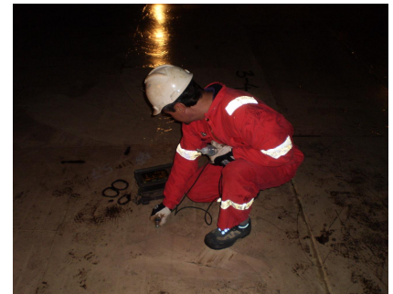
Measuring steel thickness